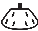
2 x 240V 13A 16A-13A Adapter