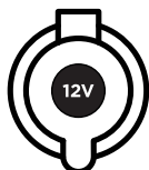
12V DC Automotive