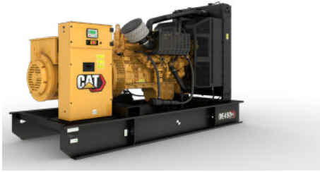
Image shown might not reflect actual configuration